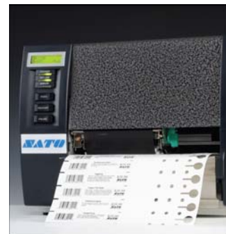
Sato's TxpSx5 model